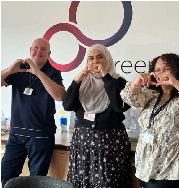
Participation People were invited to run a session for Youth Voice Champions.

This is a new staff network across our charity. Staff members discuss the insights gained from young people during the delivery of services and through client surveys, and share information between teams on best practices in youth engagement.