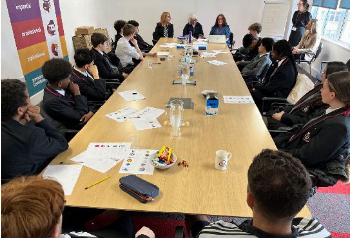
Work Experience visit at Career Connect's Head Office.