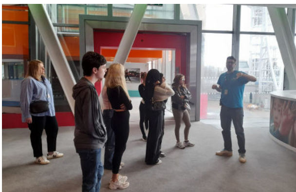
Discover Your Future programme.

In February 2024, Career Connect partnered with the Lowry Theatre and the Big Life Group to deliver the Discover Your Future programme for 16-18-year-olds not in education, employment, or training. The two-week programme is designed for young people who have expressed a preference to be in a small group, find it hard to travel independently, or may be socially isolated. The goals for some young people were to make friends, gain work experience, and build confidence.