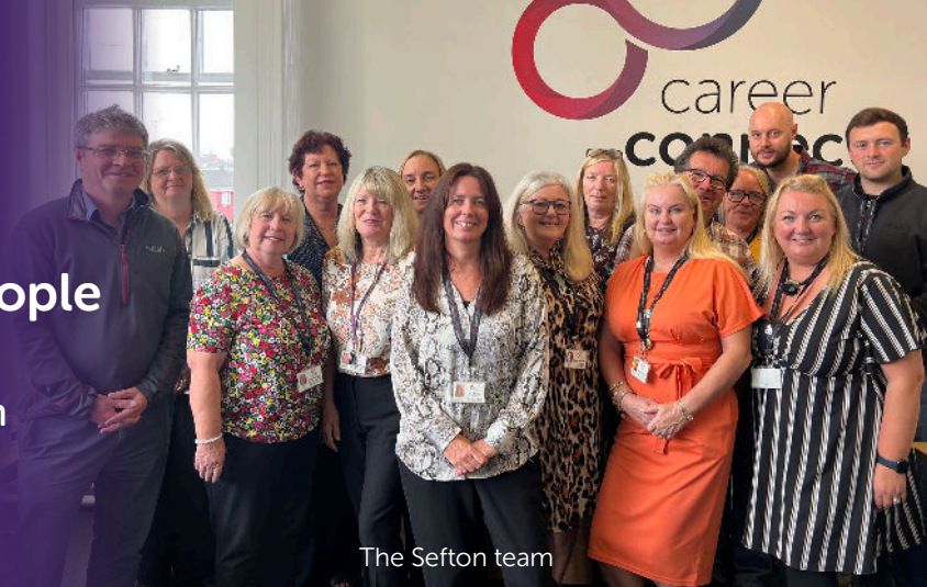
The Sefton team

Sefton NEET (Not in Education, Employment or Training) Reduction and Early Intervention Service.