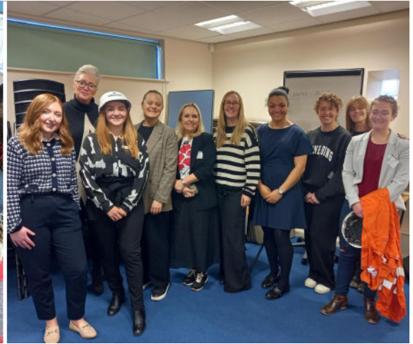
Challenging career stereotypes workshop.

In a year of growth for our school and college services, our commitment to aspirational, impactful careers education, advice and guidance is stronger than ever.